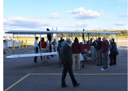
Members inspect the Silver Bird