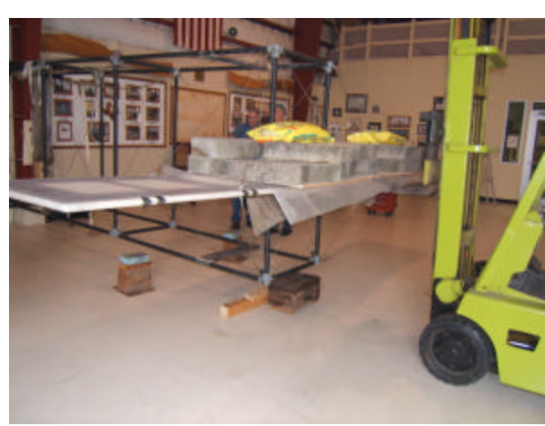
Horizontal stabilizer with 1.100 lbs. Safety fork lift

The test was accomplished using 1,100 lbs of cement blocks and salt. Picture 1 shows the tail with the full weight on it. The fork lift was used to gently and safely remove support until the full weight was taken by the structure. Picture 2 shows the crew inspecting the complete tail while it is fully loaded.