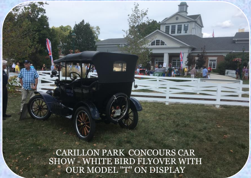
CARILLON PARK CONCOURS CAR SHOW - WHITE BIRD FLYOVER WITH OUR MODEL "T" ON DISPLAY