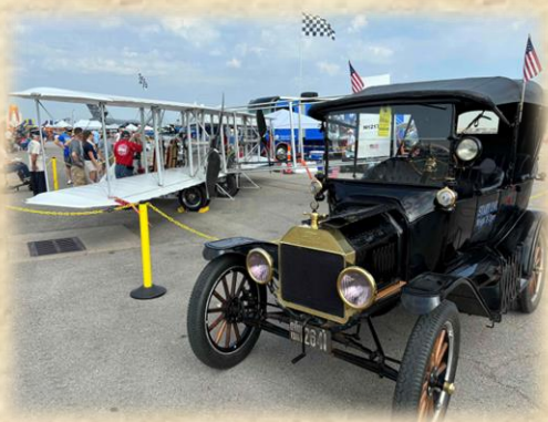
Our Display at the Dayton Airshow