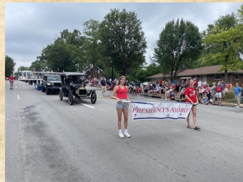
We won the President's Award at the Centerville Americana Parade