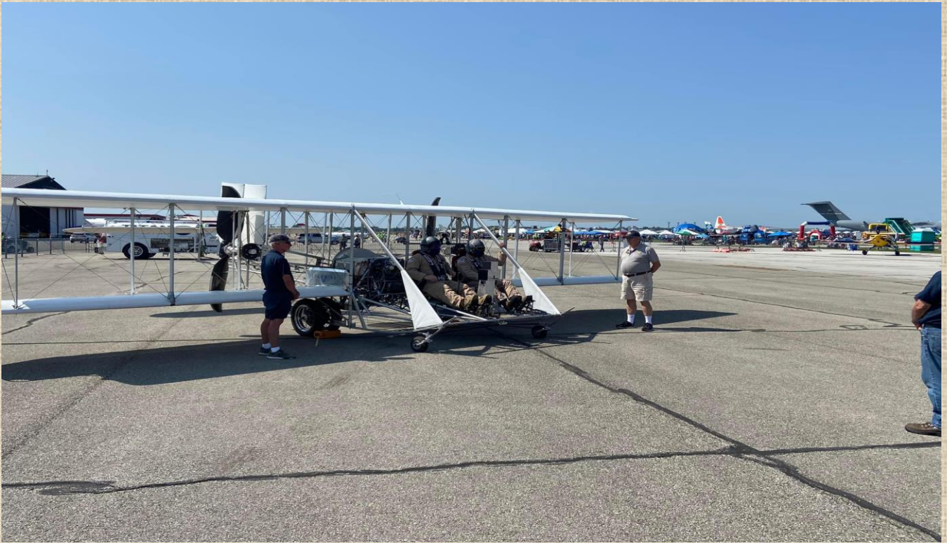
THE DAYTON AIRSHOW