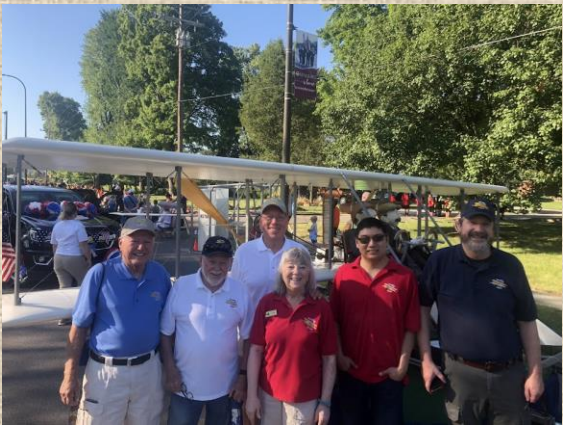
THE KETTERING HOLIDAYS AT HOMES PARADE