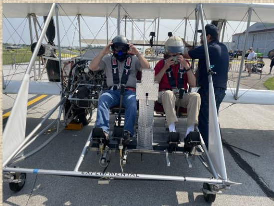
FIRST FLIGHT WINGS AND WHEELS